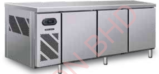
BS 3DC7/Z • BS 3DC8/Z