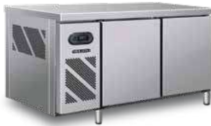
BS 2DC4/Z • BS 2DC5/Z • BS 2DC6/Z